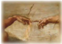
Touched by the Master's Hand.

"Powerful Life-changing Encounters With Jesus Christ."